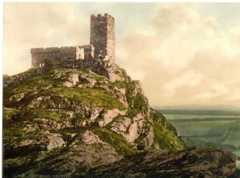
St. Michael de Rupe, Brentor